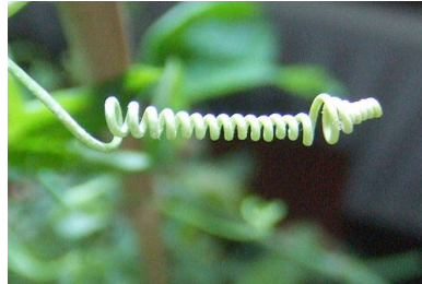
COILS / HELIX